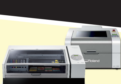
LEF2-200 / LV-180

With the VersaUV LEF2 series UV-LED printers, you can print amazingly photo-realistic colour, textures and simulated 3D embossing as well as gloss and matt finishes on objects and media up to 100 mm thick. When combined with the LV laser engraver, you have a powerful, integrated solution for creating premium-value custom items on demand. Quickly and easily produce jigs for items you want to print on your LEF to reduce set up times and ensure accurate print results.