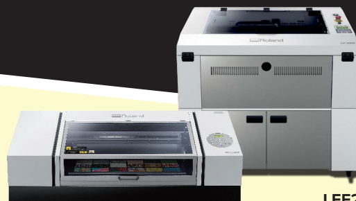
LEF2-300 / LV-290