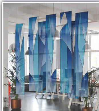
One-of-a-kind interior décor