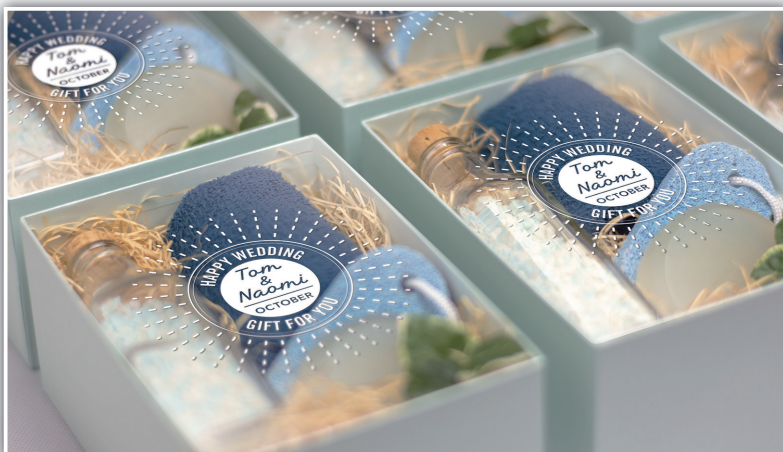
Micro-run labels for gift packaging