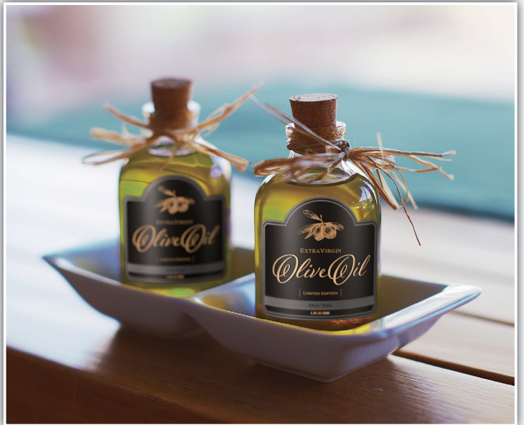
Micro-run labels for special editions