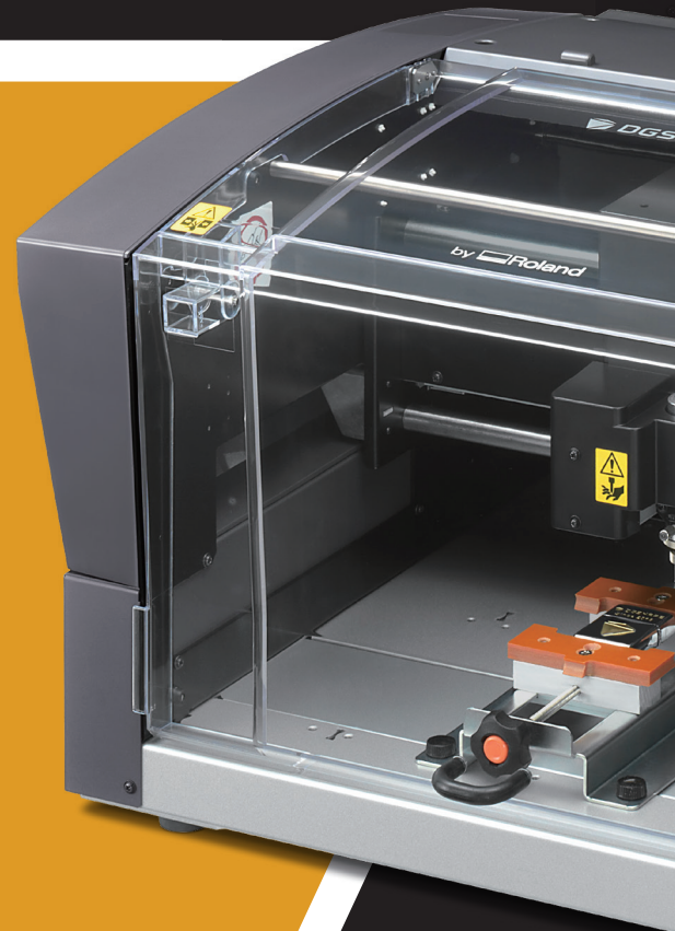
Model shown with optional centre vice

With remote machine management capabilities, the DE-3 offers USB and LAN connectivity for multiple machine engraving. Power up your production with the DE-3.