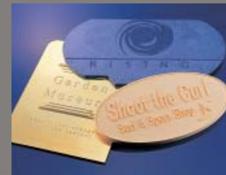
Software : Dr.Engrave