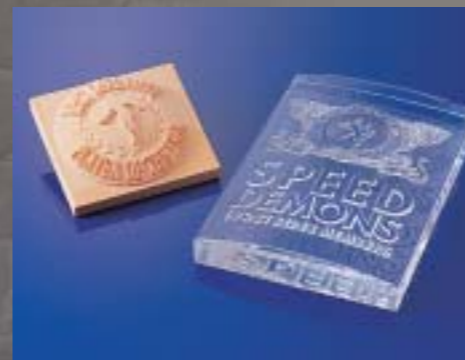
Software : 3D Engrave