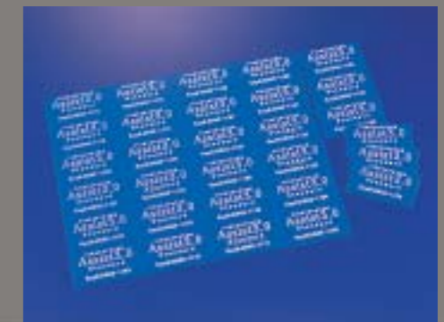
Software : Dr.Engrave